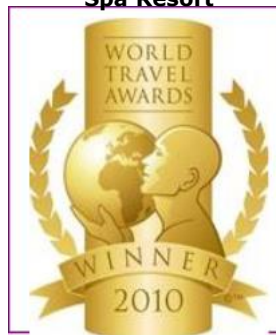
WTA – Europe's Leading Spa Resort