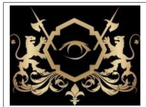
EYE AWARD – EUROPE'S BEST SPORT HOTEL