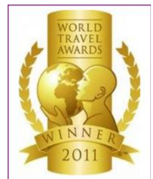
WTA – Europe's Leading Resort Villa