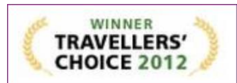
TRIPADVISOR – Top 25 All Inclusive Resorts in Europe