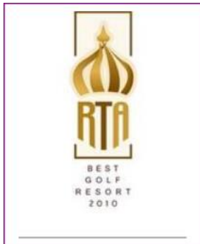
RUSSIAN TRAVEL AWARDS