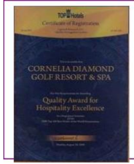
TOPHOTELS – AWARD for EXCELLENCE