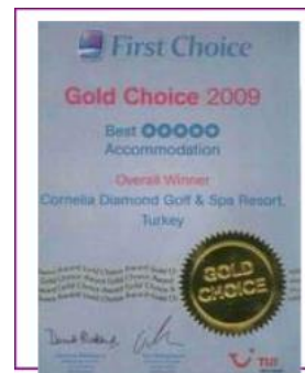
FIRST CHOICE – GOLD CHOICE