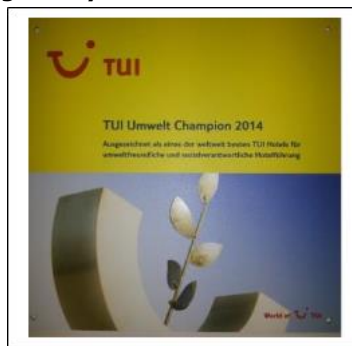
TUI – UMWELT CHAMPION