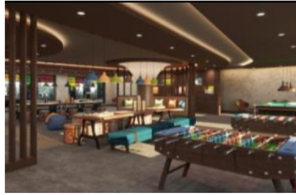
Pinbal Activity Room