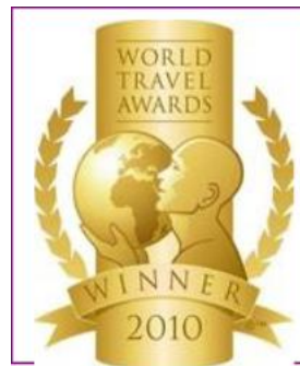
WTA – World's Leading All Inclusive Golf Resort