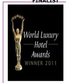
WORLD LUXURY – BEST LUXURY GOLF RESORT