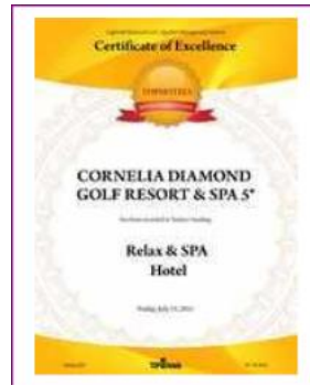
TOPHOTELS – Turkey's Leading Relax & SPA