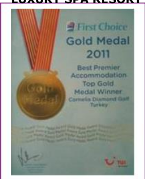
FIRST CHOICE – GOLD MEDAL