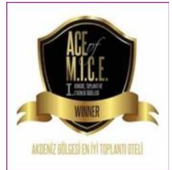
ACE of MICE – Best Congress Hotel in Antalya