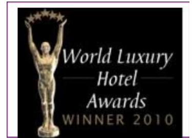
WORLD LUXURY – BEST LUXURY GOLF RESORT