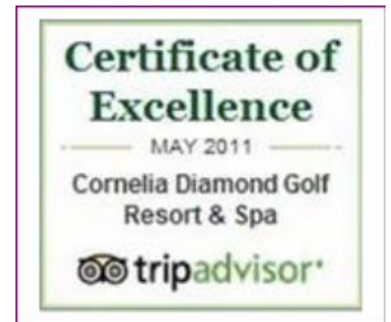
TRIP ADVISOR – CERTIFICATE of EXCELLENCE