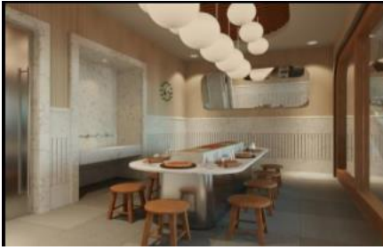
Pizza Making Facility area