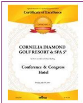
TOPHOTELS – Turkey's Leading Conference