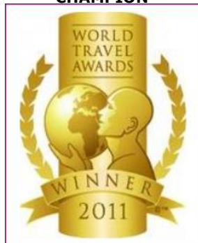
WTA – Europe's Leading Luxury Resort