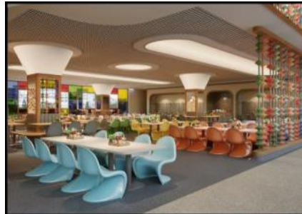
Cornie Kids Club Restaurant