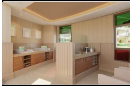
Food Preparation Room