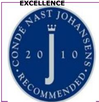
CONDE NAST – RECOMMENDED HOTEL