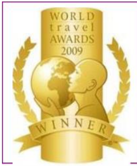
WTA – Europe's Leading Golf Resort