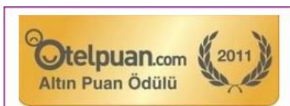
OTEL PUAN GOLD