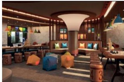
Activity Area /