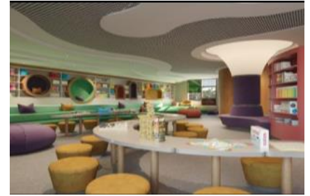
Game Activity Area