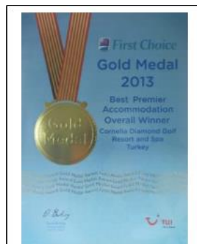
FIRST CHOICE – GOLD CHOICE