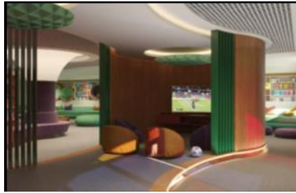
Playstation & Wii Game Room