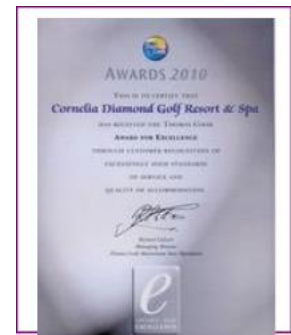
MARK for EXCELLENCE