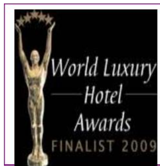
WORLD LUXURY – LUXURY GOLF RESORT