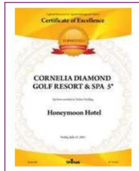
TOPHOTELS – Turkey's Leading Honeymoon