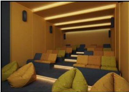
3 Cinema Halls