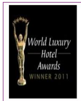
WORLD LUXURY – BEST LUXURY SPA RESORT