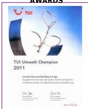
TUI – UMWELT CHAMPION