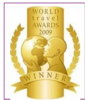
WTA – Europe's Leading Spa Resort