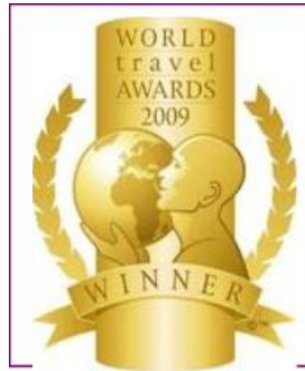
WTA – Turkey's Leading Spa Resort