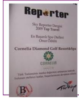
REPORTER MAG. – BEST SPA HOTEL