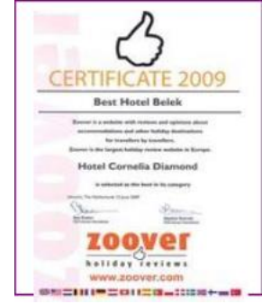
ZOOVER – BEST HOTEL BELEK